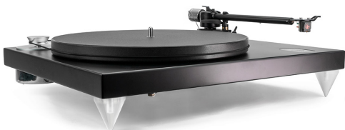
Valore 425 Lite