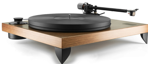
Valore 425 Plus